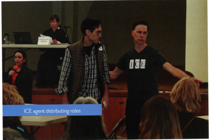
ICE agent distributing roles